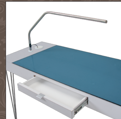
LED lamp with high-quality brushed steel finish and convenient accessories drawer included