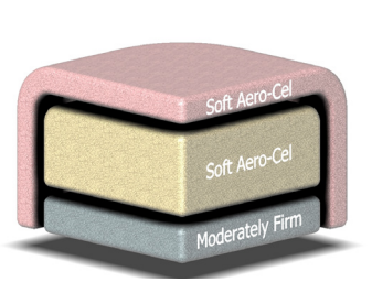
4" Aero•Cel <sup>™</sup> Superior comfort